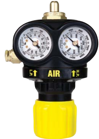
ESS3 FLOW DATA