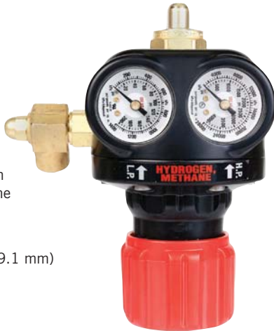
ESS4 FLOW DATA