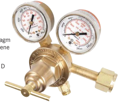
SR250 FLOW DATA